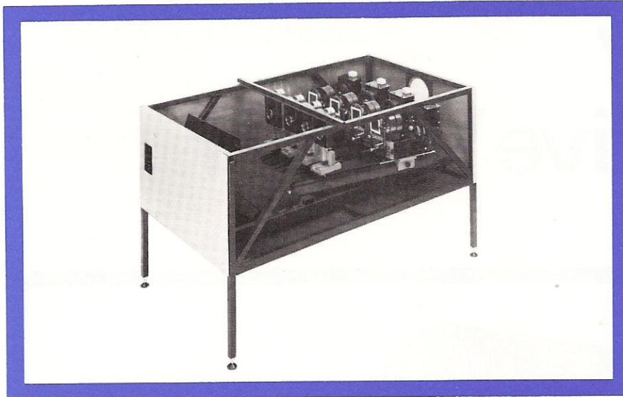
Interior of Viewer